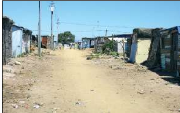
Level 2 Fair / reasonable standard of cleanliness