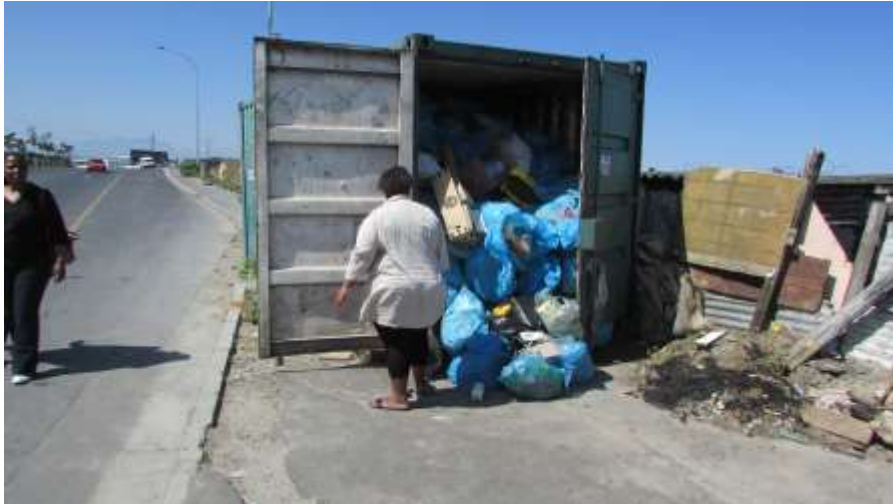
Resident carrying her refuse to a shipping container in DT section.

refuse directly from dwellings. The cleaners said that they collect the refuse either from “skips” that were used in the previous collection system or from makeshift drop-off points (such as street corners), to take to the shipping containers.