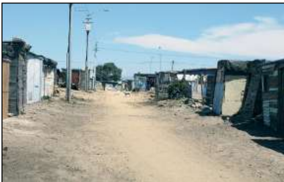
Level 1 Desired standard of cleanliness

We inspected the City's monitoring forms. At least 95% of the areas inspected received ratings of 2, 3 or 4; it was extremely rare for a contractor to get a rating of 1 for area cleaning for a given section. A large majority of residents interviewed (329, or 71%) during the audit also expressed unhappiness with the standards of cleanliness provided by the contractors responsible for refuse collection.