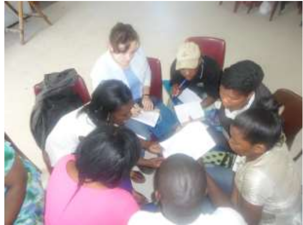
Above and below: Teams analyse documents in preparation for developing questionnaires and going into the field

Our analysis of the documents provided clarity on how the service should be implemented in Khayelitsha and which contractors were responsible for the different areas.