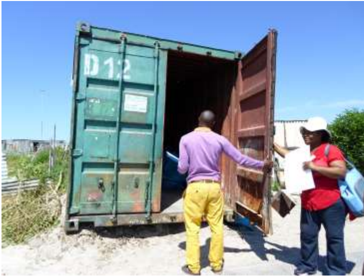
Inspecting a shipping container in Enkanini

On 02, 03 and 04 October, each group undertook the fieldwork element of the social audit. Each team focussed on the informal settlements serviced by the contractor they had been assigned. Teams also inspected the shipping containers and their surrounds in their areas.