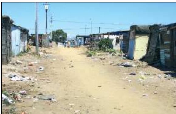
Level 3 Unacceptable standard of cleanliness