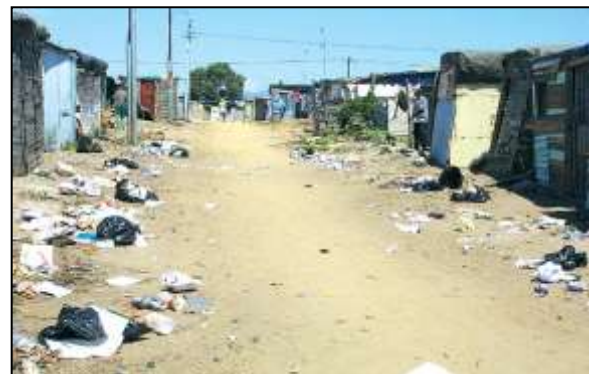
Level 4 Totally unacceptable standard of cleanliness